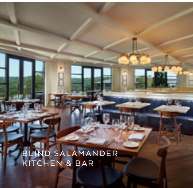
BLIND SALAMANDER KITCHEN & BAR