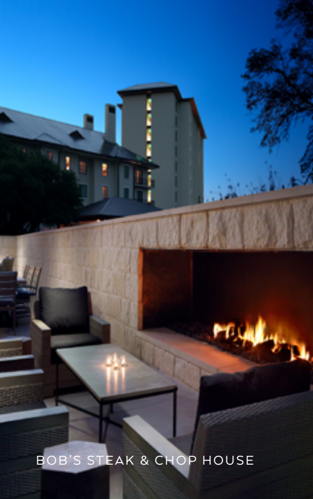
BOB'S STEAK & CHOP HOUSE